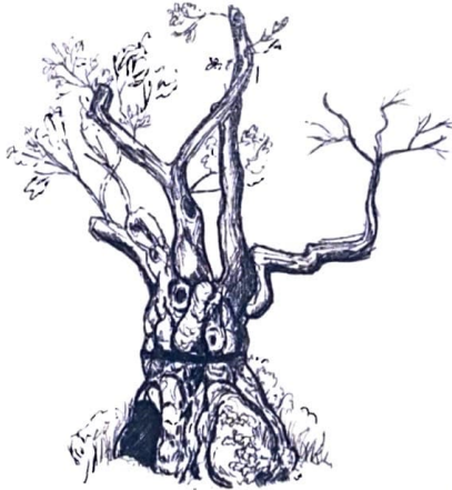
Big Belly Oak

Return to the main path and continue for half a mile. Turn right when you reach GRAND AVENUE. At 3.9 miles, the beech-lined avenue is the longest in Britain, stretching from the outskirts of Marlborough to almost the front door of Tottenham House.